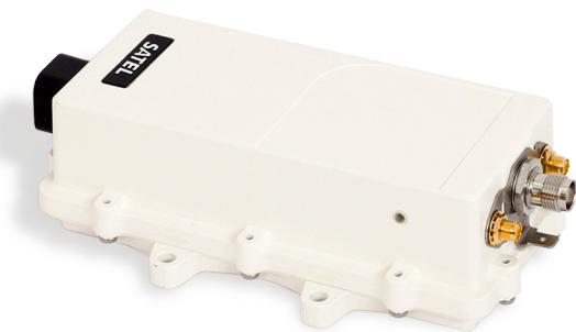
SATEL MCCU-20 LTE / UHF